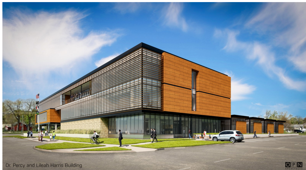
Dr. Percy and Lileah Harris Building