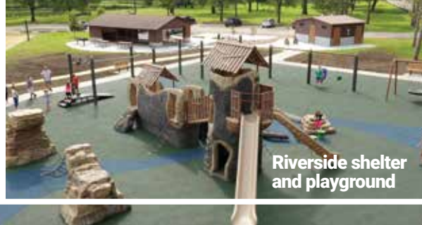
Riverside shelter and playground

Get full details, make reservations, and learn about activities at Pinicon Ridge Park and all Linn County Conservation facilities at LinnCountyIowa.gov/Conservation