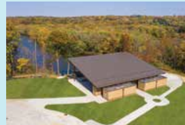
WAPSI BLUFF SHELTER

Reservable lodges and shelters are popular for family, corporate and social events. Horseshoe Falls and Woodpecker lodges are enclosed, equipped with a full kitchen with outdoor space, and are available year round. Eagle View, Flying Squirrel, Riverside, and Wapsi View open aired shelters are available during the warm recreation season. For more information and to reserve lodges, shelters, cabins, and group camps, click facilities at LinnCountyIowa.gov/Conservation